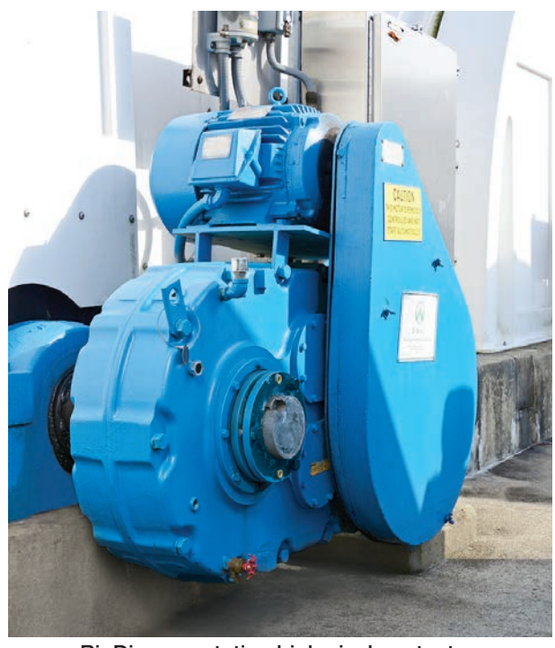
BioDisc on rotating biological contactor.

Overcoming the challenges of an aging infrastructure and managing operating and capital costs is among the top concerns today in the Wastewater Industry. With over a century of experience, Baldor designs and manufactures innovative, robust, efficient mechanical power transmission products that are built to last in the harshest of environments. Our corrosion resistant materials and coatings, along with advanced sealing technologies were developed with demanding wastewater applications in mind. These features result in improved output, reduced downtime, less costly operation and maintenance, and more reliable performance. Baldor is committed to offering products and services to address the wastewater issues now and into the future.