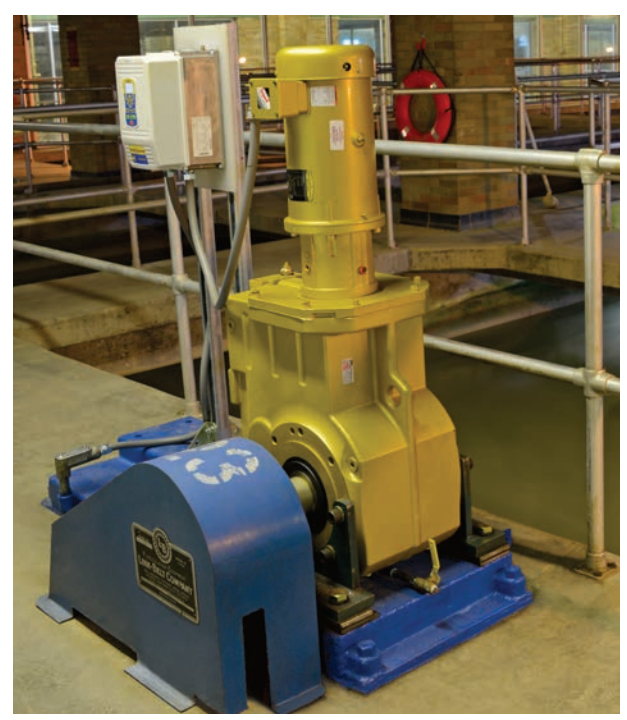
Quantis reducer in flocculation.

Delivering an adequate and continuous supply of water for residential, public, commercial, fire, and industrial utilization is a fundamental objective of every water treatment plant. At Baldor, we understand the criticality of providing uninterrupted water supply and have designed mechanical power transmission products and solutions for high performance and superior reliability. Our products are built to perform dependably under conditions such as constant moisture, extreme temperatures, and chemical exposure. Baldor is dedicated to providing products that reduce your plant's operating costs and meet the increasing demand for water.